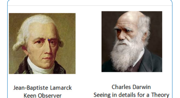
Figure 1: Of the two well-known evolutionary scientists, Charles Darwin could be described as one who sees for a generalised theory of evolution while Jean Baptiste Lamarck, a keen observer of outward characteristics offering a solid situational theory.

In the context of social science, behaviour constitutes the characteristics of the being. Behaviour is in observable plane. Nature of a person is in his interior, which is not observable. The outwardly expressed character might be thus different from what is there in his/ her nature. When you are asked to look into an object/subject, you are asked not only to observe but also to see. You observe the outward character but you see the inner nature. Character is what is expressed. Nature is what is within (Figure1).